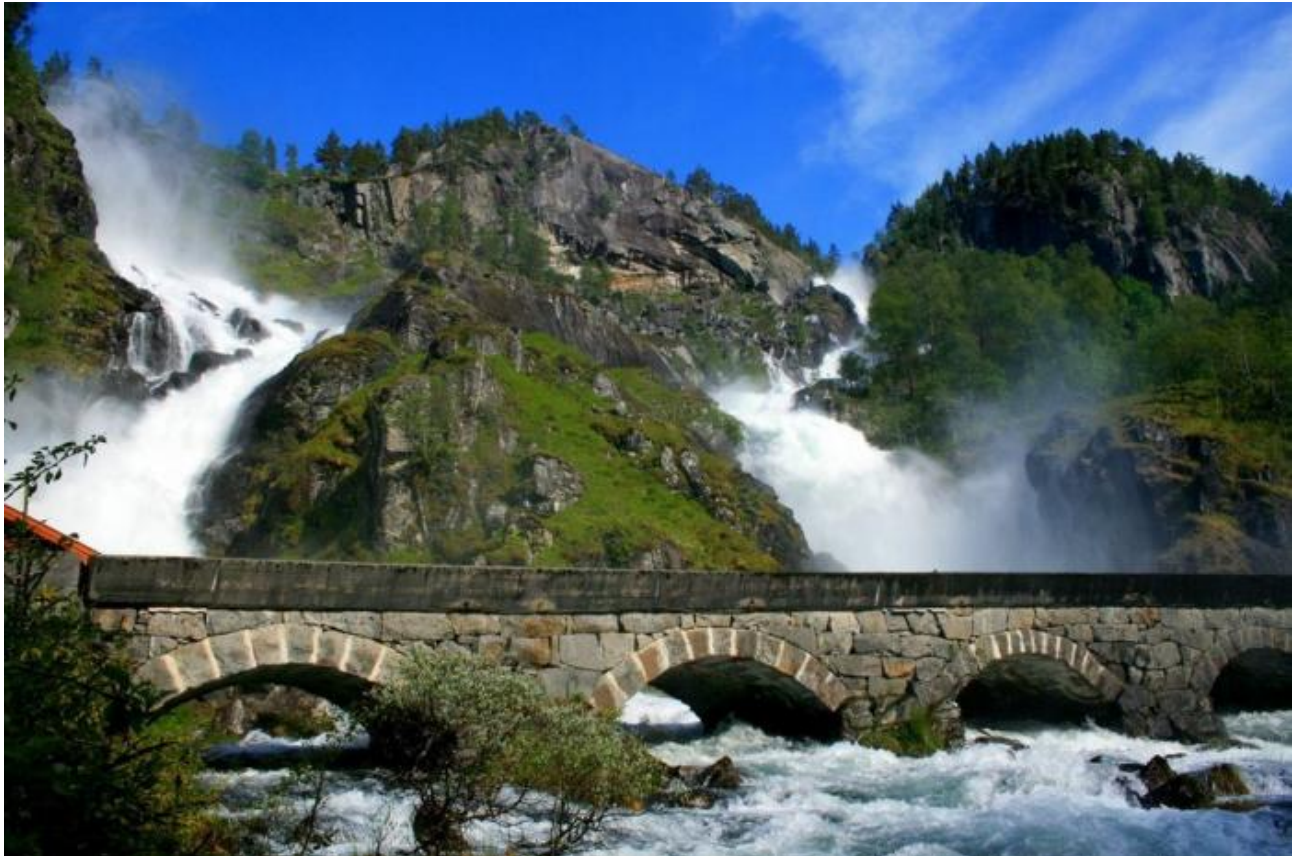
Låtefossen is unique among Norwegian waterfalls: two streams coming together on the side of a mountain just before they merge into another river in the valley below.

"Jesus gave Himself as spiritual food and True Presence among us in the Blessed Sacrament. In our own century at Fatima, Mary asked the three children and us to, 'Pray the Rosary every day.' Here we see two marvelous founts of grace flowing together.