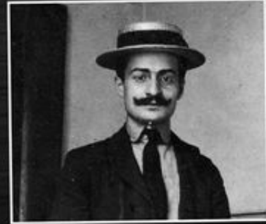
The Catholic Gentleman