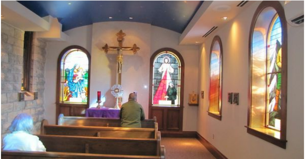
St Michael Catholic Church Adoration Chapel - Stillwater, MN - USA

“Let us remain in adoration: and to Him, who, in order to save us, humbled Himself to such a degree of poverty as to receive our body, let us offer not only incense, gold and myrrh , the first as God, the second as king, and the third as one who sought death for our sake, but also spiritual gifts more sublime than those which can be seen with the eyes” ( Oratorio ).