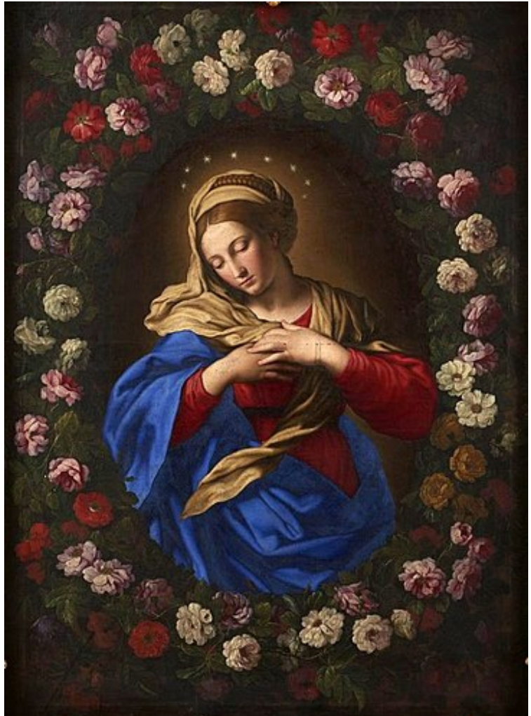
Giovanni Battista Salvi de Sassoferrato (1600s)