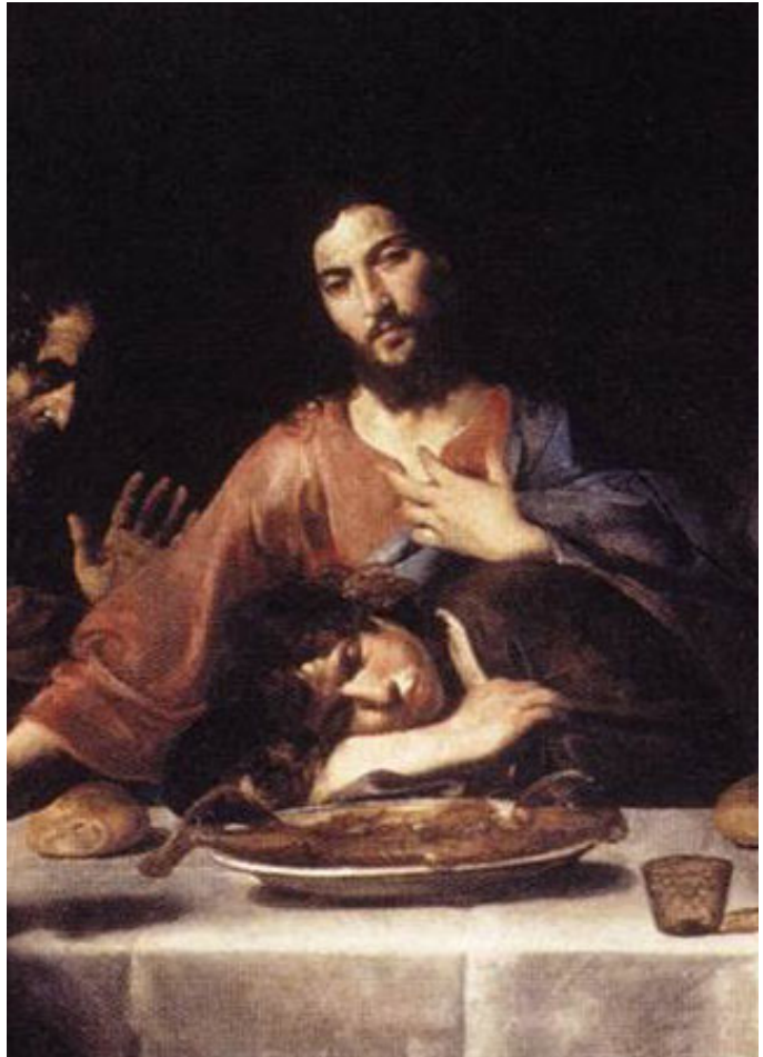
Valentin de boulogne

Click here: St. John the Apostle - YouTube (7:30 mins)