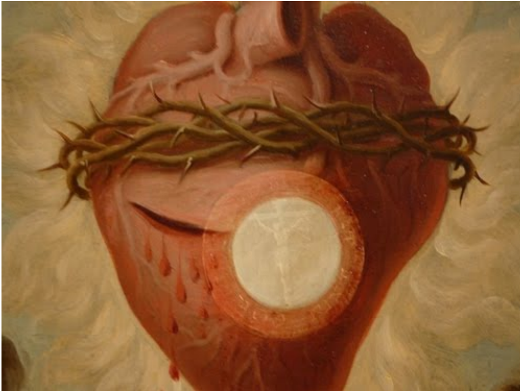
Icon: Sacred Heart of Naur (Jordan)

The Word became flesh and made his dwelling among us, and from his fullness we have all received - Jn 1:14,16 (Today's Communion Antiphon)