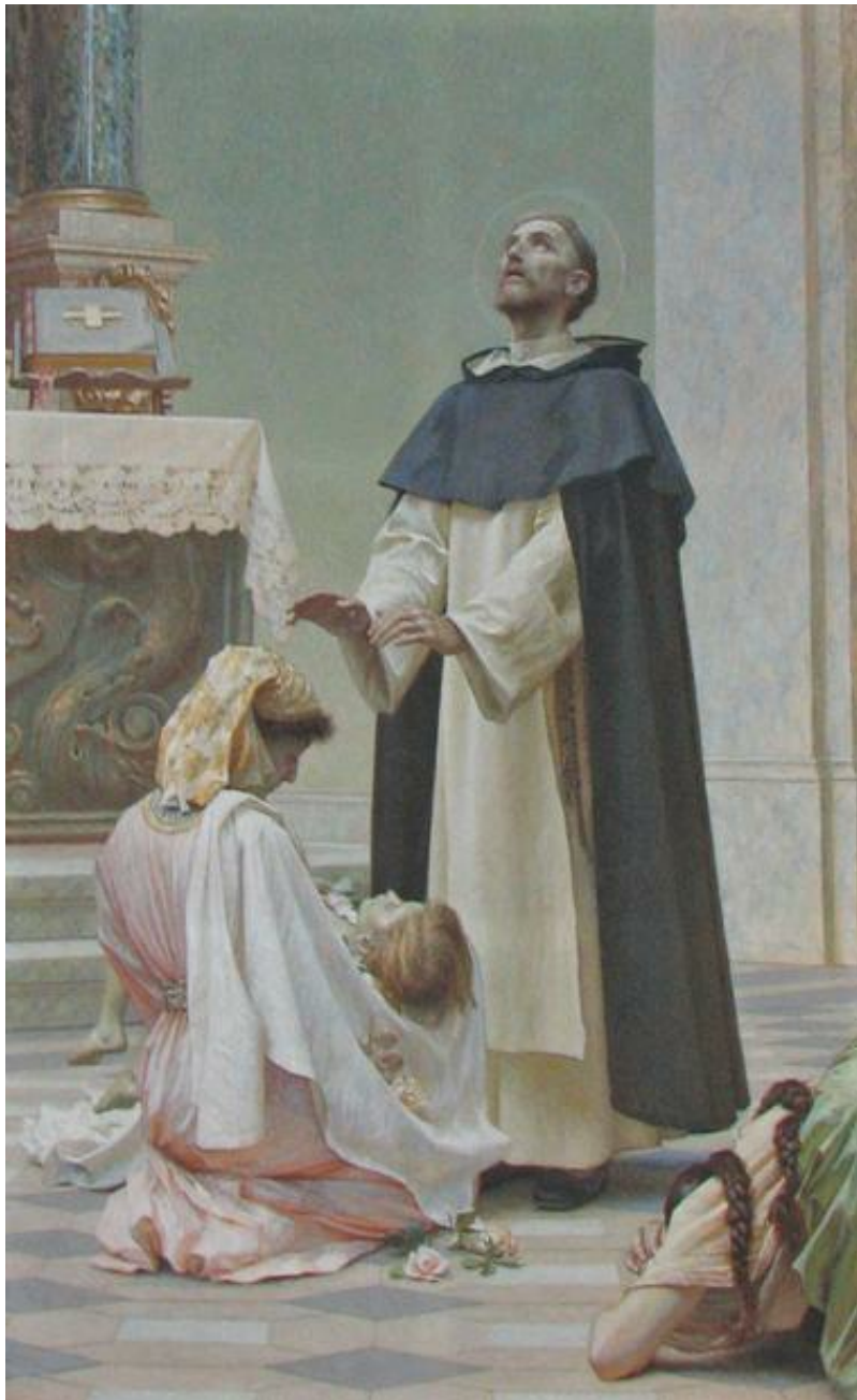
The Miracle of Saint Dominic

The heavens praise your wonders, O LORD, your faithfulness too, in the assembly of the holy ones. - Psalm 9:10