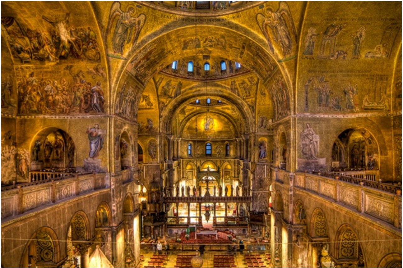
Basilica San Marco ~ Venice, Italy

Contains the reliquary of St Mark's body